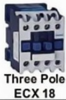
Three Pole ECX 18